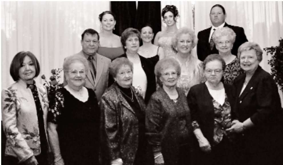
The Debutante Ball Committee paused a moment to celebrate the successful completion of months of planning.

More coverage and photos are found on page three of this issue