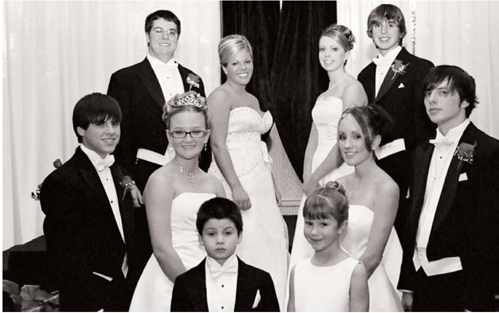
The 2007 Debutantes and Escorts along with our Page Boy and Page Girl