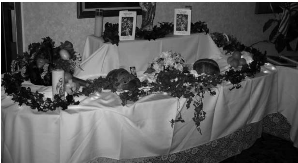
A traditional display table for the annual St Joseph's dinner