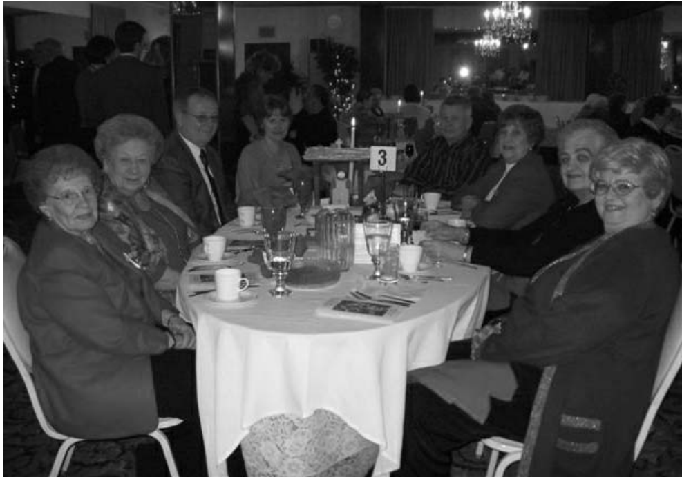
Members enjoying the dinner