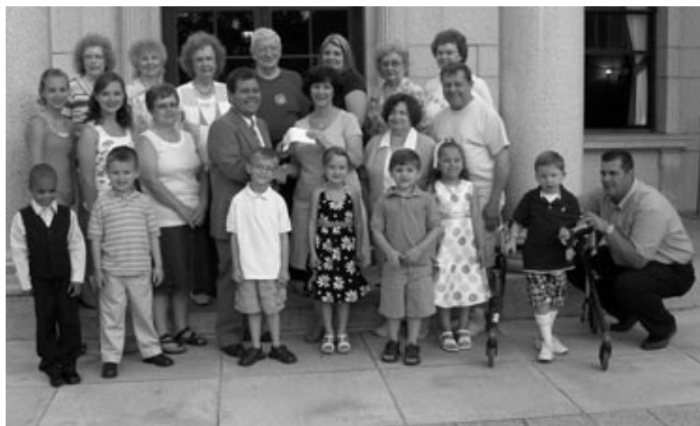
Photo: Volunteers from the Fraternal Societies of N.E. PA present a sponsorship check to Wyoming Valley Children's Association.

The Fraternal Societies of Northeastern PA include: First Catholic Slovak Ladies Association, Greek Catholic Union, Ladies PA Slovak Catholic Union, National Slovak Society of USA, Polish National Union, Polish Union of USA, Slovak Catholic Sokol and Ukrainian Fraternal Association.